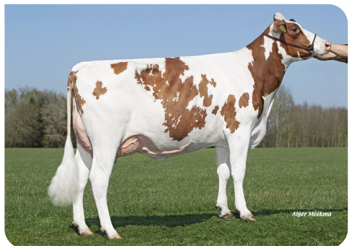
Grashoek Janna 155 (s. Macgyver) Owner: Fok- en melkveebedrijf K.I. Samen B.V., Grashoek (NL)