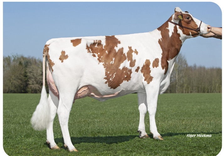
Grashoek Janna 155 (s. Macgyver) Owner: Fok- en melkveebedrijf K.I. Samen B.V., Grashoek (NL)