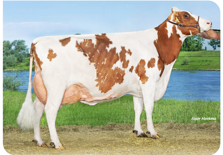
Grashoek Janna 155 (s. Macgyver van de Peul)(4th calf) Owner: Fok- en melkveebedrijf K.I. Samen B.V., Grashoek (NL)