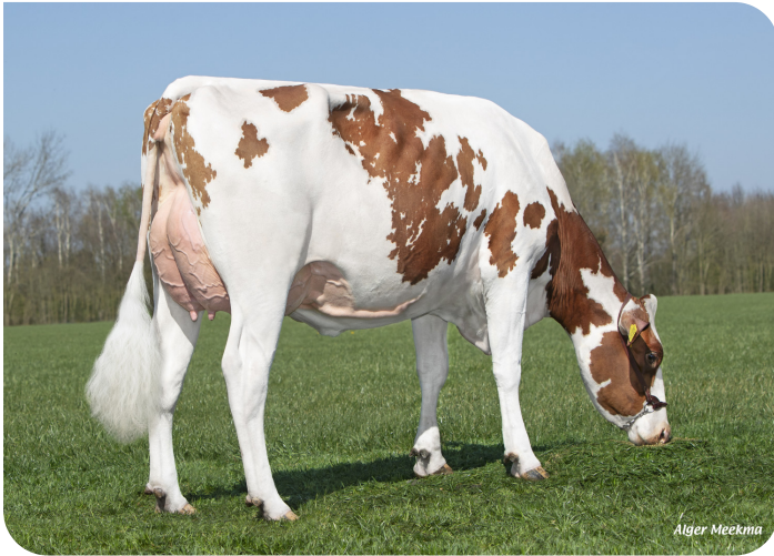
Grashoek Janna 155 (VG 89)(s. Macgyver) Owner: Fok- en melkveebedrijf K.I. Samen B.V., Grashoek (NL)