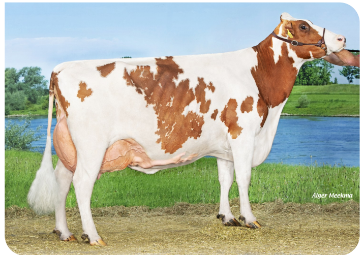
Grashoek Janna 155 (s. Macgyver van de Peul)(4th calf) Owner: Fok- en melkveebedrijf K.I. Samen B.V., Grashoek (NL)