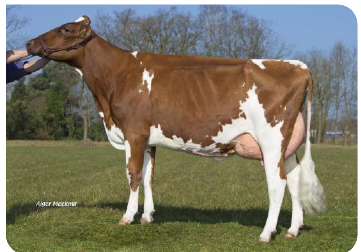
Grashoek Mitzi 9 (s. Lady Lover) Owner: Fok- en melkveebedrijf K.I. SAMEN, Grashoek (NL)