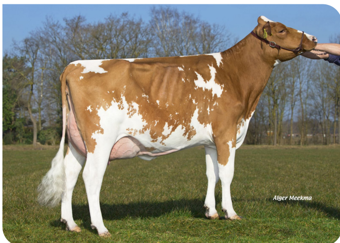
Grashoek Tonnie 72 (s. Lady Lover) Owner: Fok- en melkveebedrijf K.I. SAMEN, Grashoek (NL)