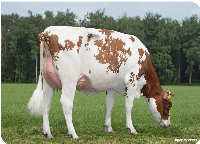
Grashoek Silke 269 (s. Tucson) Owner: Melkveebedrijf Grashoek b.v., Grashoek (NL)