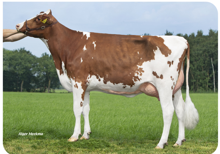
Grashoek Nel 203 (VG 85) (s. Tucson) Owner: Melkveebedrijf Grashoek b.v., Grashoek (NL)