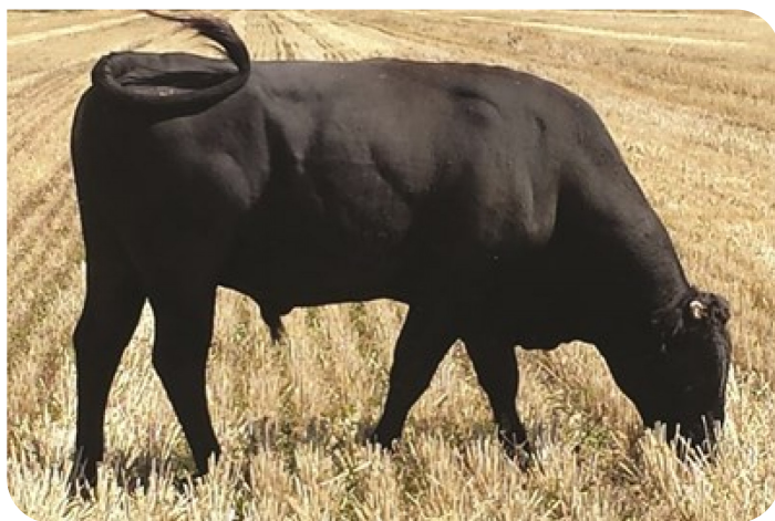
Itomoritaka (father of Kentaro)