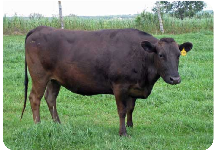
Misako (great-grand dam Kentaro)