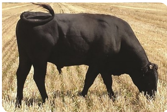
Itomoritaka (father of Kentaro)