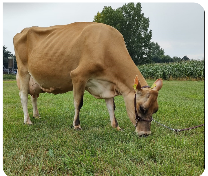
Anouk 2 (VG 87) Dam of Jouke