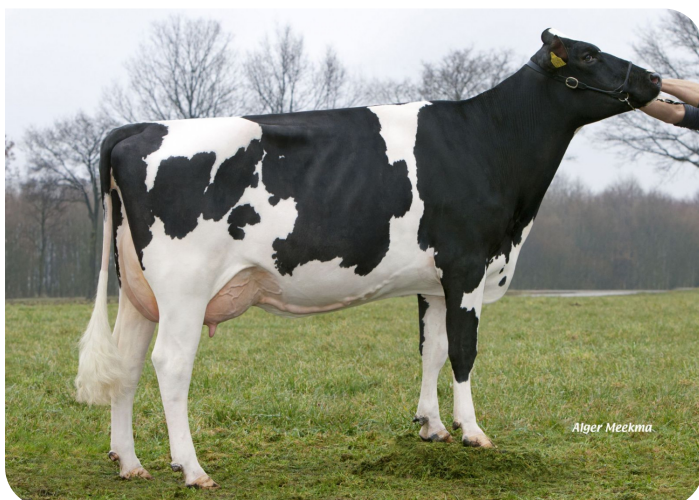
Irma 29 (s. Mr. Justin)

Owner: V.O.F. Gebleektendijk, Nederweert-Eind (NL)