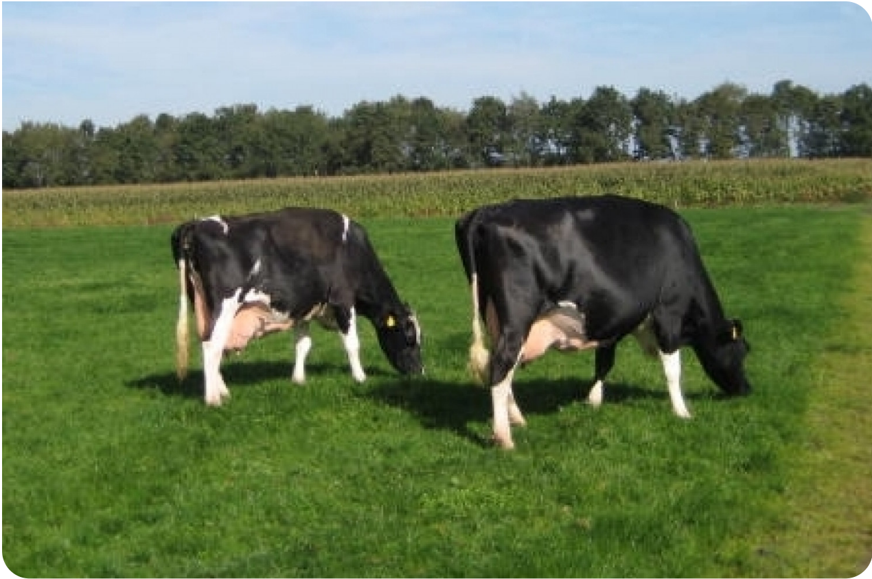
Leentje 44 (before calving)(VG 88) & Leentje 19 (EX 91) (dam & granddam of Mr. Justin)