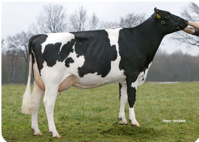
Irma 29 (s. Mr. Justin)

Owner: V.O.F. Gebleektendijk, Nederweert-Eind (NL)