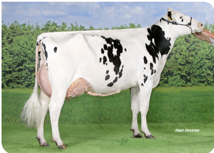
JIMM. Holstein Hellen 589 (EX 94) (dam of Mr. Winner)