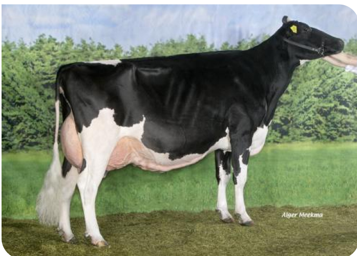
JIMM. Holstein Hellen 585 (EX 93) (granddam of Mr. Winner)