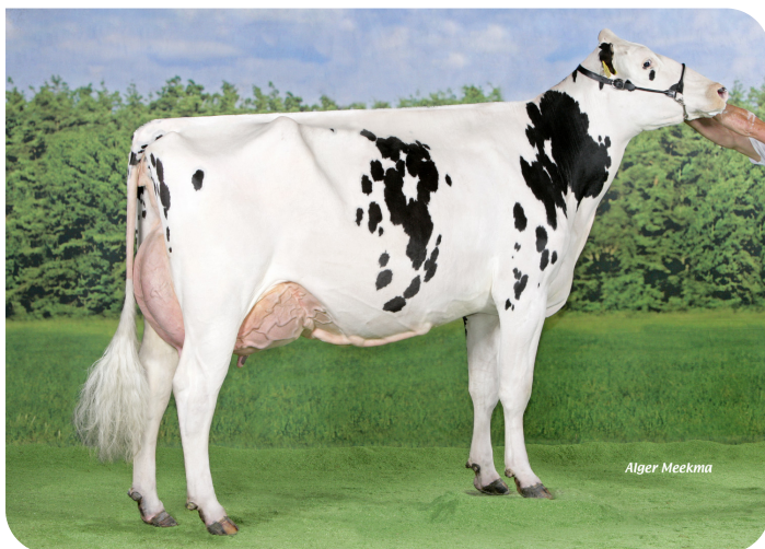
JIMM. Holstein Hellen 589 (EX 94) (dam of Mr. Winner)