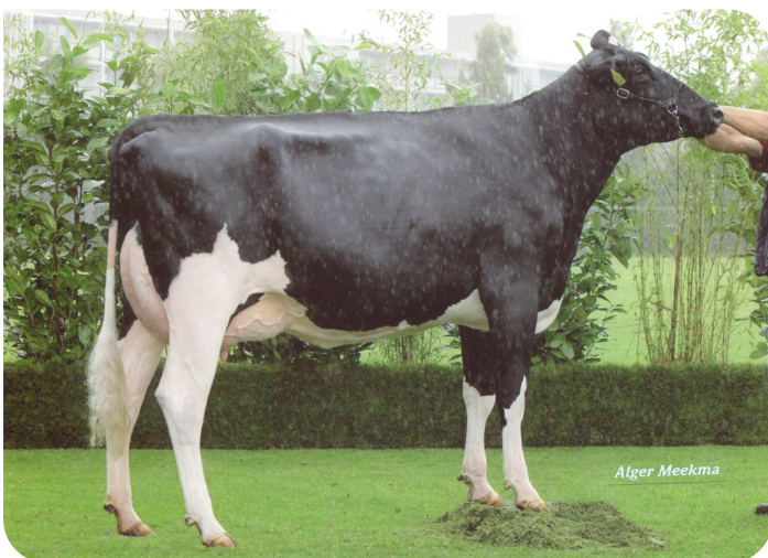
Venetie 5 (VG 89) (granddam of Mr. Bobo)