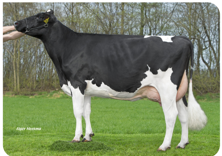
Nijnke 12 (s. Mr. Bobo) Owner: Vreba Melkvee B.V., Vredepeel (NL)