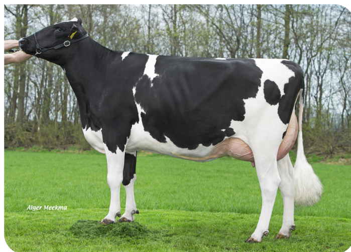
Pietje 1012 (s. Mr. Bobo) Owner: Vreba Melkvee B.V., Vredepeel (NL)