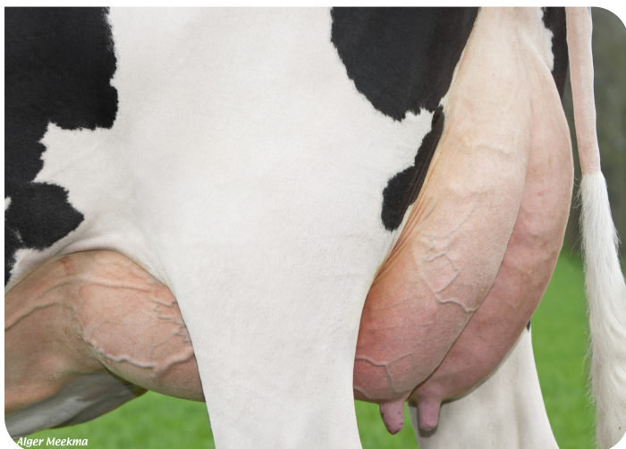
Udder of Pietje 1012 (s. Mr. Bobo) Owner: Vreba Melkvee B.V., Vredepeel (NL)