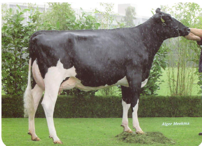
Venetie 5 (VG 89) (granddam of Mr. Bobo)