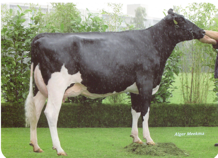
JIMM Holstein Venetie 5 (VG 89) (grand dam of Iceman)