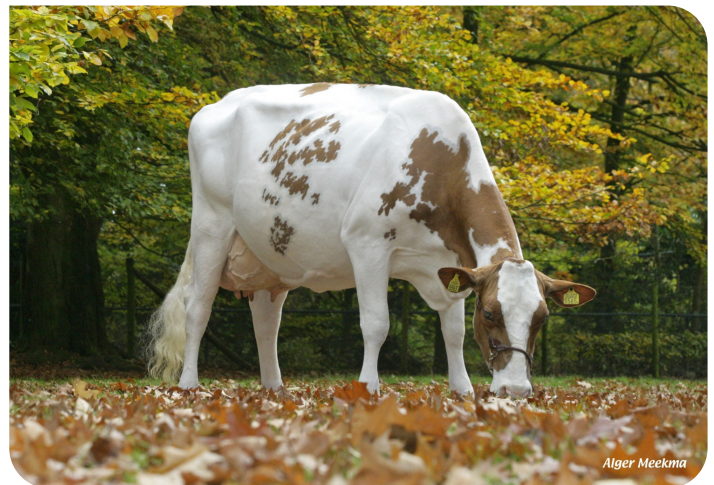
J&G Meisi 5 (VG 89) (dam of Marsman)