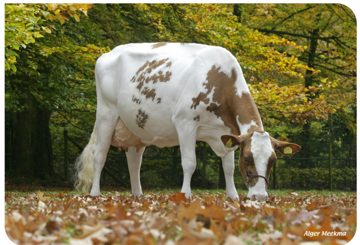
J&G Meisi 5 (VG 89) (dam of Marsman)