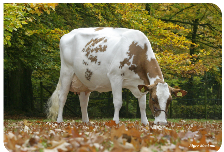
J&G Meisi 5 (VG 89) (dam of Marsman)