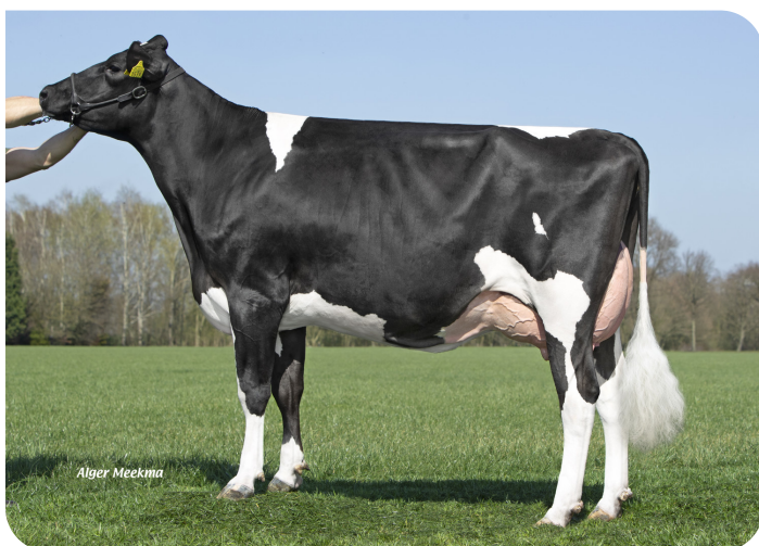
Grashoek Antonia 171 (s. Marsman) Owner: Melkveebedrijf Grashoek, Grashoek (NL)