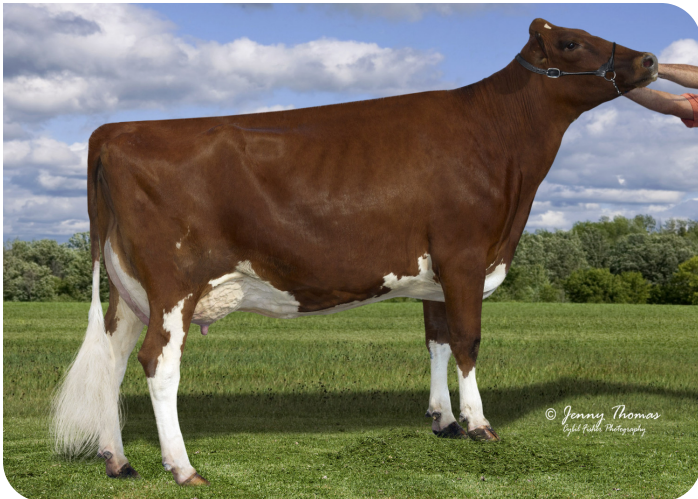
Golden-Oaks Dura Rae-P-Red (VG 88) (dam of Rex-PP-Red)