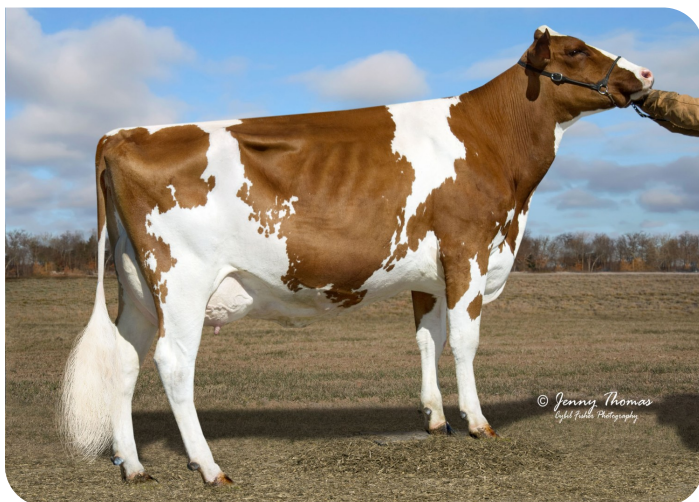
Ja-Bob Wunder Hollie-P-Red Great-grand dam of Horizon P-Red