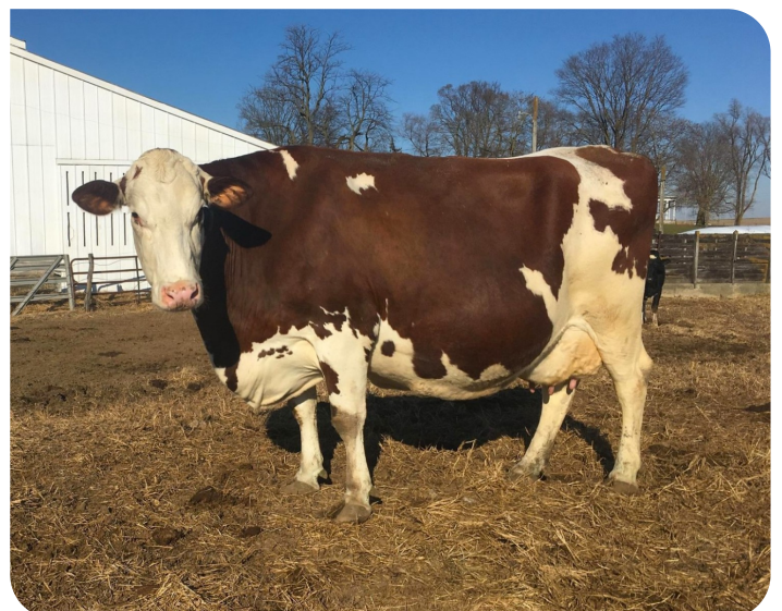
Ja-Bob Pembroke Holli-P-Red (VG 85) Grand dam of Horizon P-Red