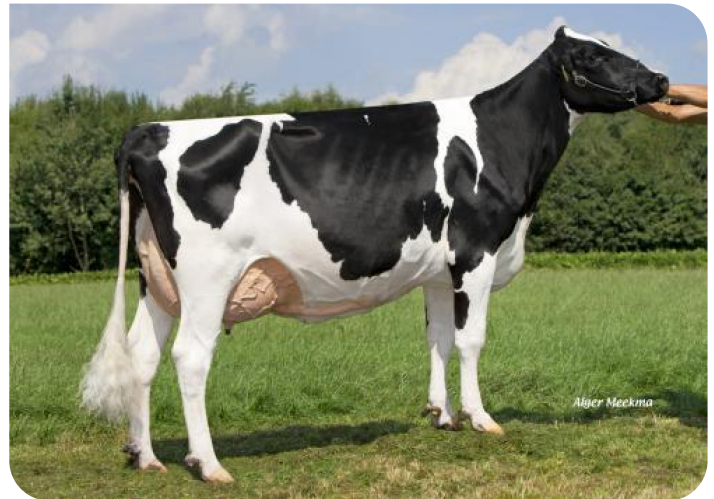
Grashoek Nel 118 Pp (s. Timeless (Pp)) Owner: Melkveebedrijf Grashoek b.v., Grashoek (NL)