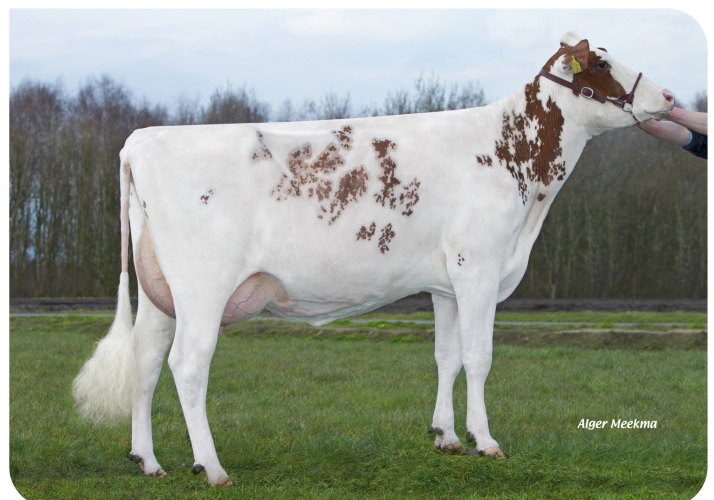
Grash. Corrie 520 (VG88) & Grash. Silke 130 (VG88) (s. Timeless (Pp)) Owner: Melkveebedrijf Grashoek b.v., Grashoek (NL)