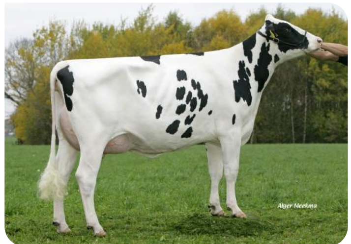
Grashoek Silke 130 (VG 88) (s. Timeless (Pp)) Owner: Melkveebedrijf Grashoek b.v., Grashoek (NL)