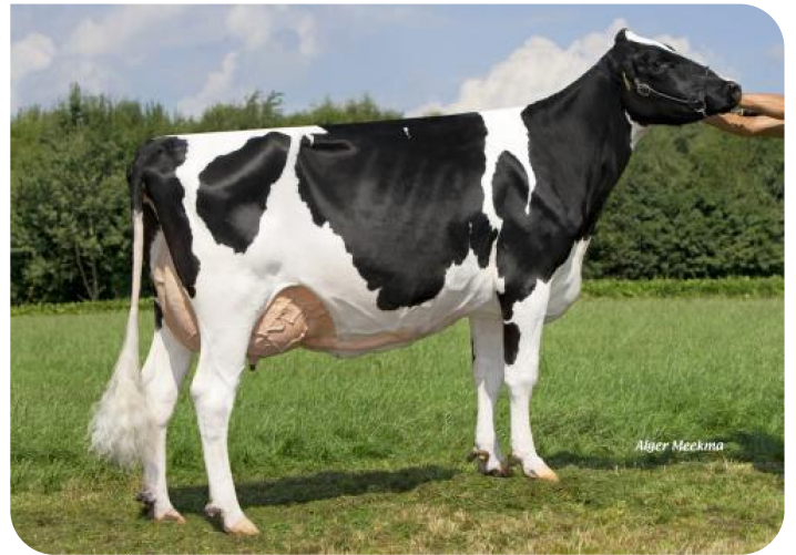
Grashoek Nel 118 Pp (s. Timeless (Pp)) Owner: Melkveebedrijf Grashoek b.v., Grashoek (NL)