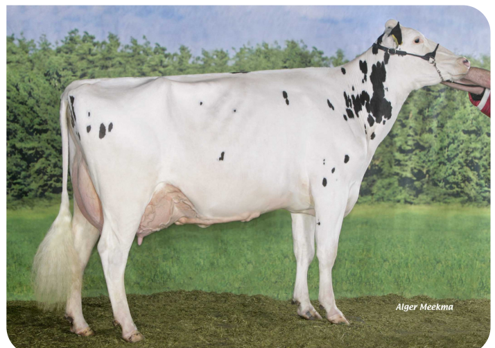
J&G Redspot 16 (EX 90) (granddam of Gidion)