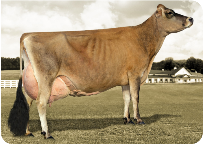
Hawarden Jace Pix (EX 95) Great grand dam of Porter-P