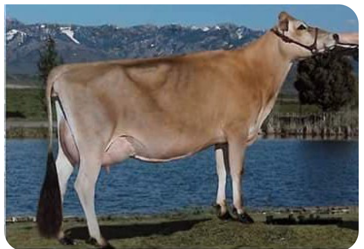
Hawarden Implus Pixy (VG 88) Grand dam of Porter-P