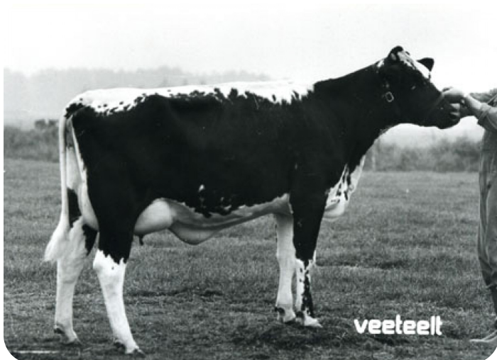
Reigerbek (dam of Ijdel)