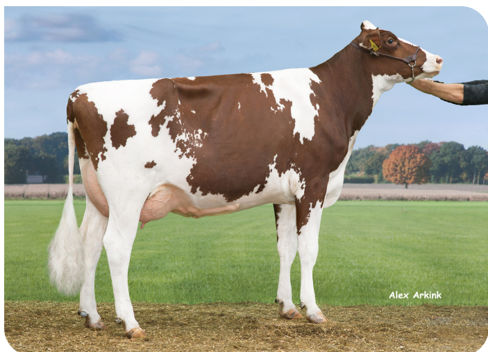
Huntje Anemoon 117 (VG 86) (dam of Red River)