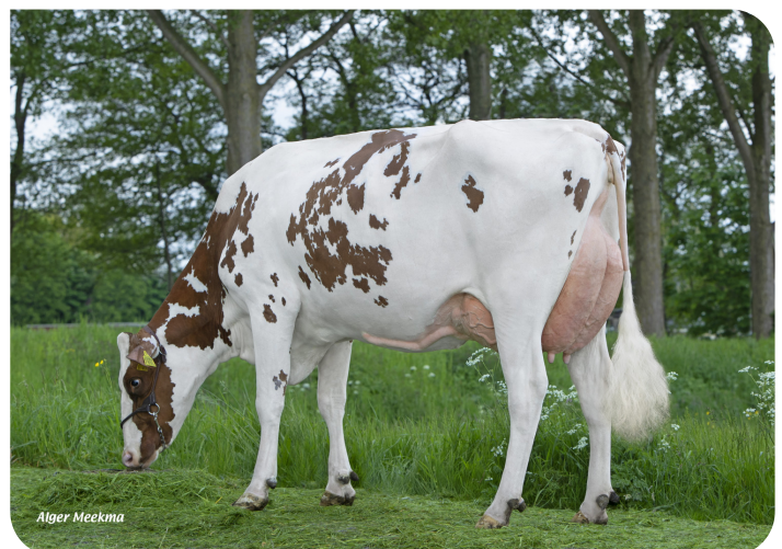
Corrie 90 (s. Red River) (2nd lactation) Owner: VOF Verhoef Dairy Farm, Nieuwerbrug aan de Rijn (NL)