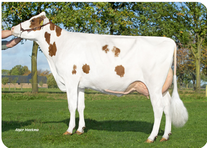
Liza 410 (s. Red River) Owner: Agri-Services Fokmelkveebedrijf Frencken, Reuver (NL)