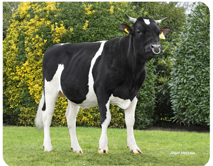
Holwerda Finbar 2