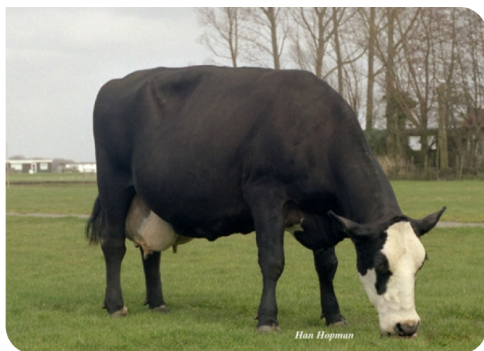
Marleen 21 (dam of Julius HM)