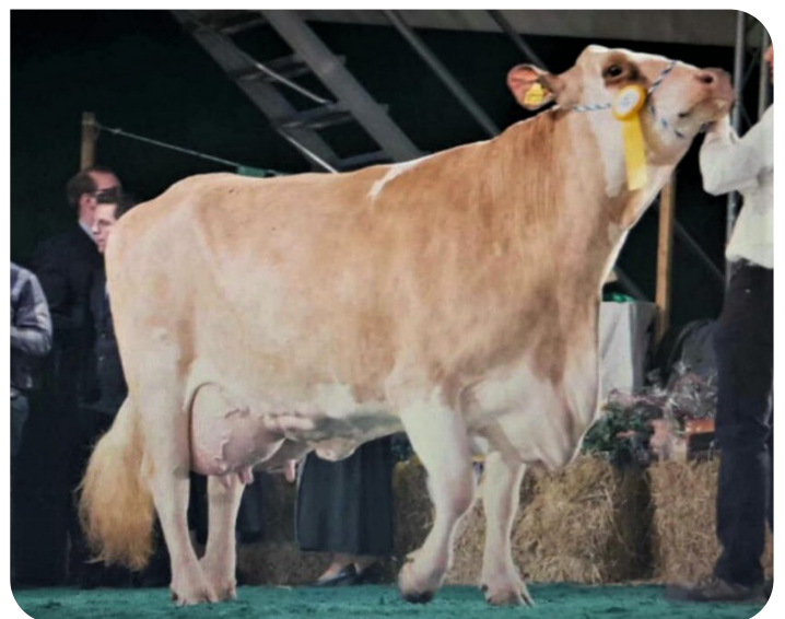
Shirley 1 (3rd lactation) (dam of Haiko)