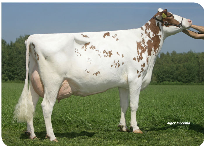
Willem's Hoeve Rita 0249 (VG 87) (granddam of Time Zone (Pp))