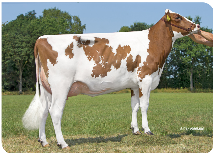
Grashoek Mina 480 (s. Time Zone (Pp)) Owner: Melkveebedrijf Grashoek b.v., Grashoek (NL)