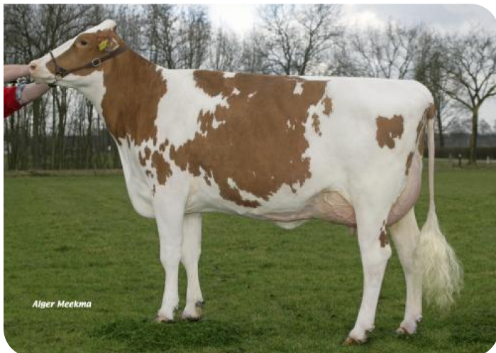
Grashoek Silke 80 (VG 87) (granddam of Moneymaker rf)