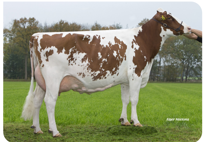
Grashoek Silke 136 (VG 85) (dam of Moneymaker rf)