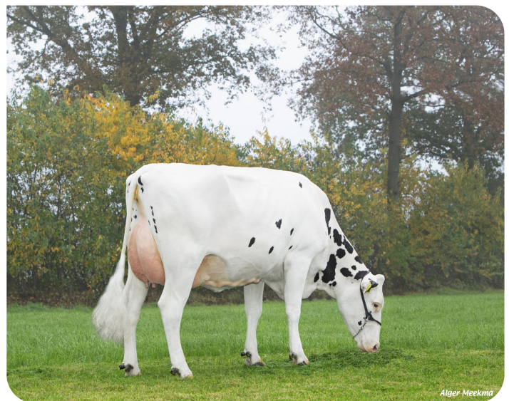
Quarrel 54 (s. Mareno)