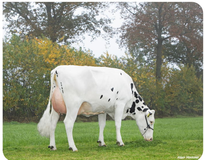
Quarrel 54 (s. Mareno)