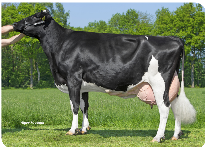
Desibon 32 (VG 87) (dam of Mareno)