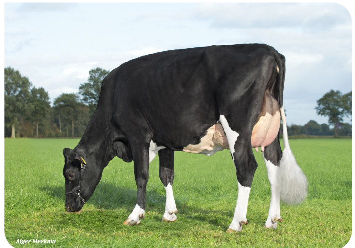
Grashoek Nel 193 (s. Kentucky (Pp)) Owner: Melkveebedrijf Grashoek, Grashoek (NL)