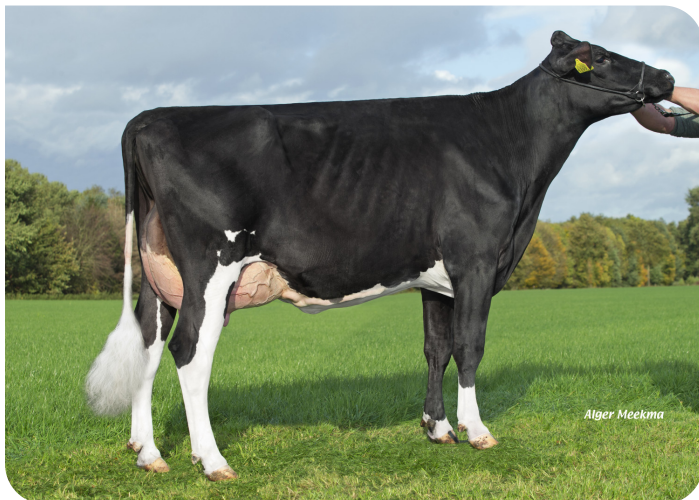
Grashoek Nel 193 (s. Kentucky (Pp)) Owner: Melkveebedrijf Grashoek, Grashoek (NL)