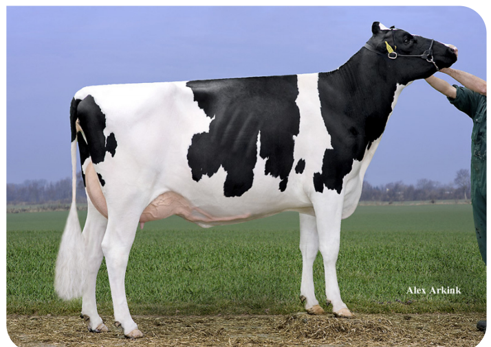
Drouner AJDH Aiko (VG 87) (dam of Kentucky (Pp))