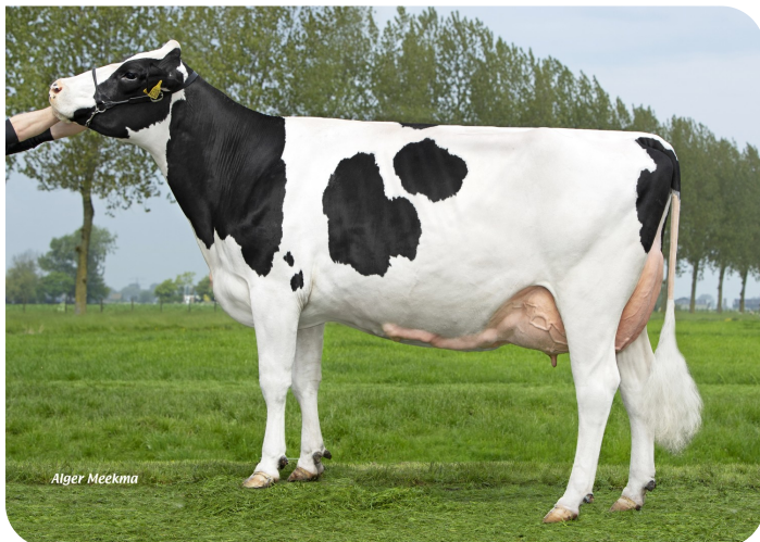
Beatrix 364 (s. Conqueror)