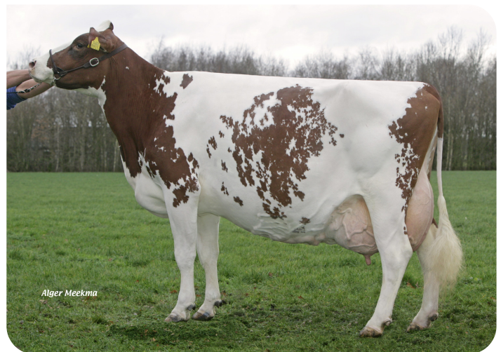
Mien 36 (VG 88) Dam of Conqueror P