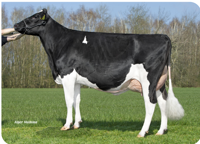
Grashoek Everette 10 (s. Conqueror P) Owner: Melkveebedrijf Grashoek b.v., Grashoek (NL)

2.04 269d 7713 kg 4.67% 3.68% 3.03 330d 8795 kg 5.27% 4.25% 4.03 340d 9542 kg 4.81% 3.94% 5.05 411d 11280 kg 4.90% 4.02% 6.08 468d 12113 kg 5.32% 4.20% 8.03 538d 15611 kg 5.21% 3.89% 84 79 88 83 VG 85