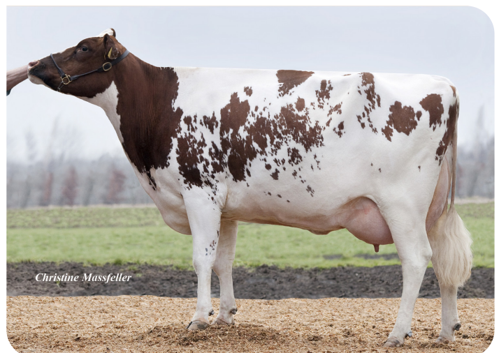
RH Meggy-J (VG 88) (dam of Gandalf)