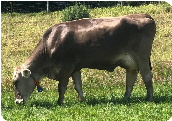
Fiësta (1ste lact.) (dam of Frank)