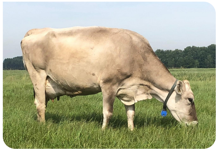
Fuxi (grand-dam of Frank)