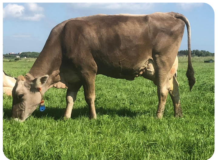
Fiësta (2e lact.) (dam of Frank)