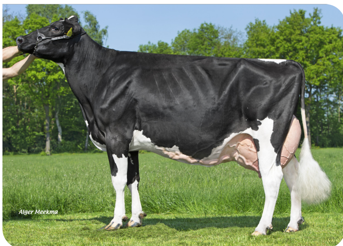
HBC Jerudo Alves AD (fullsister of FaWi Pirlo rc) Owner: Melkveebedrijf Grashoek b.v., Grashoek (NL)