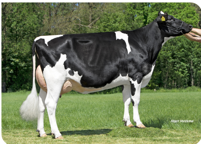
Trix 95 (s. FaWi Caruso)