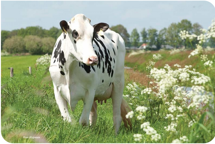
Anderstrup Ramos Camill (EX 90) (dam of FaWi Caruso)