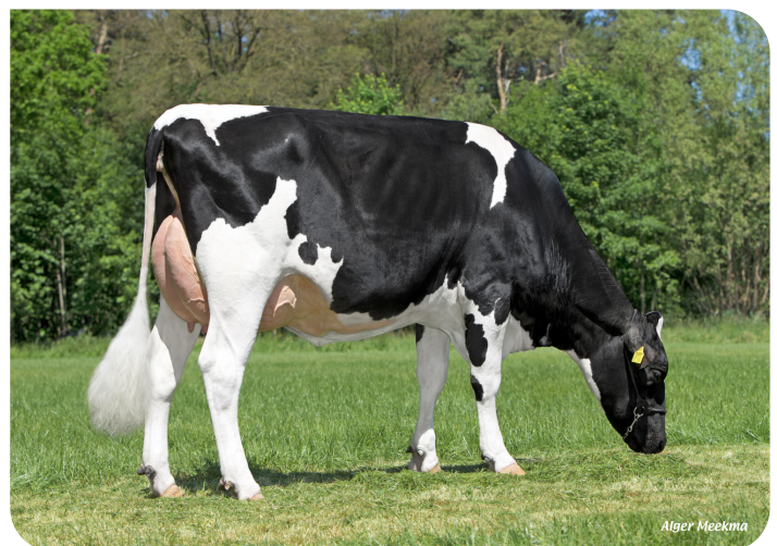
Trix 95 (s. FaWi Caruso)