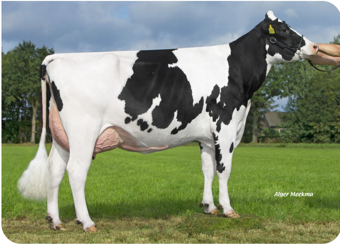
Grashoek Trees 610 PP (s. Eragon Pp) Owner.: Melkveebedrijf Grashoek b.v., Grashoek (NL)