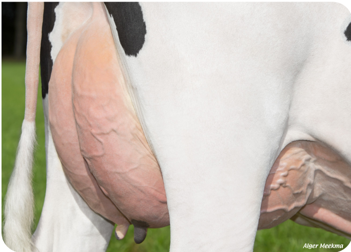
Udder of Grashoek Trees 610 PP (s. Eragon (Pp)) Owner: Melkveebedrijf Grashoek b.v., Grashoek (NL)