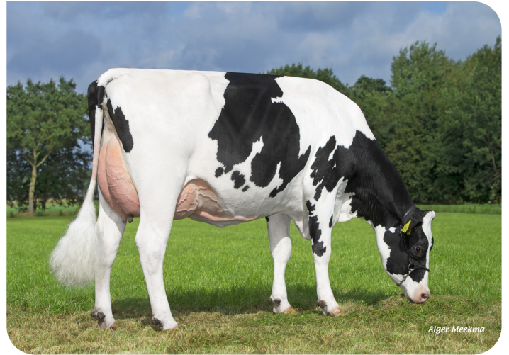
Grashoek Trees 610 PP (s. Eragon (Pp)) Owner: Melkveebedrijf Grashoek b.v., Grashoek (NL)