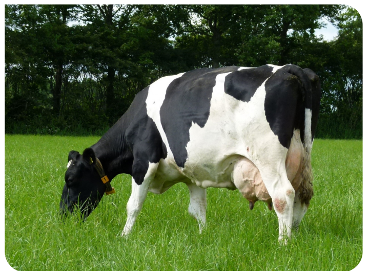
Emma 530 (granddam of Eppie 2)