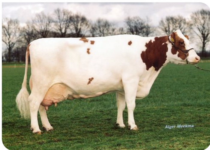
Dz Mies 118 (VG 86) (granddam of Thijmen)