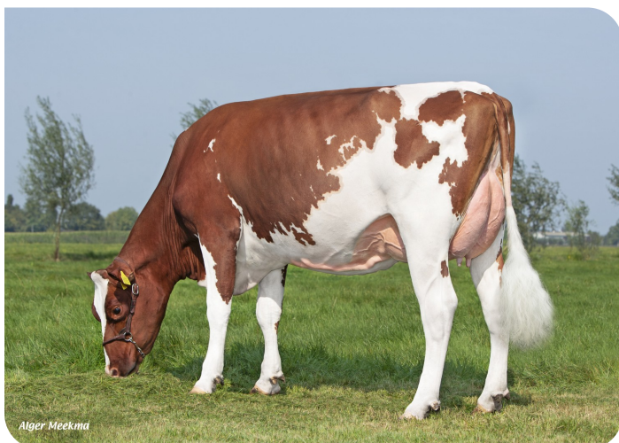
Neeltje 23 (s. Magician RC)

Owner: Verburg-de Groot V.O.F., Reeuwijk (NL)