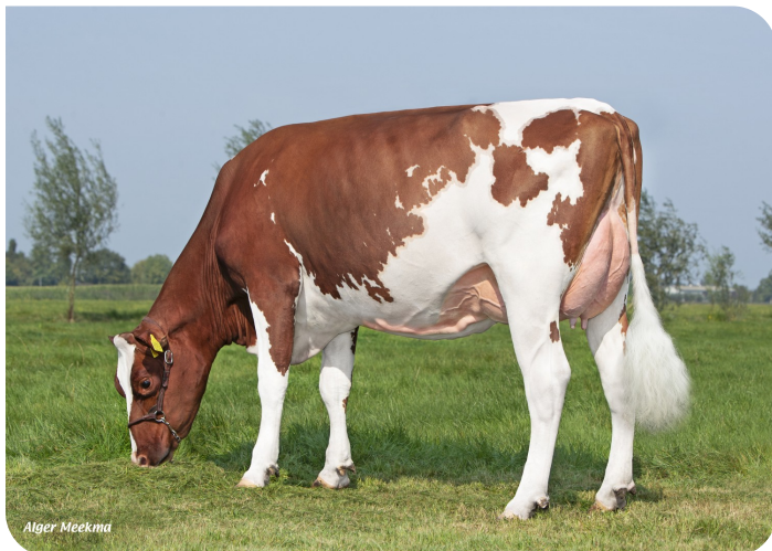
Neeltje 23 (s. Magician RC)

Owner: Verburg-de Groot V.O.F., Reeuwijk (NL)