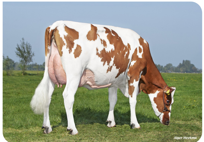
Emma 273 (s. Magician RC)

Owner: Verburg-de Groot V.O.F., Reeuwijk (NL)