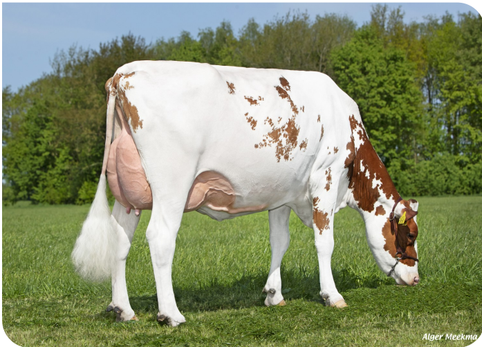
Grashoek Elsje 73 (s. Magician) Owner: Fok- en melkveebedrijf K.I. Samen B.V. (NL)