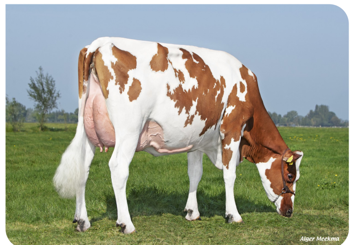
Emma 273 (s. Magician RC)

Owner: Verburg-de Groot V.O.F., Reeuwijk (NL)