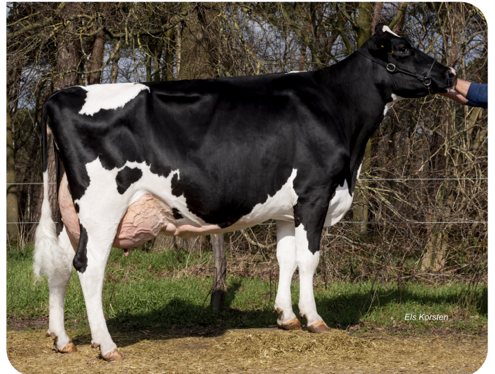
Delta Madame 6 (VG 87) Dam of Magician RC