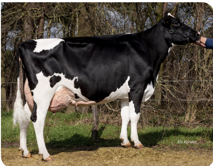
Delta Madame 6 (VG 87) Dam of Magician RC