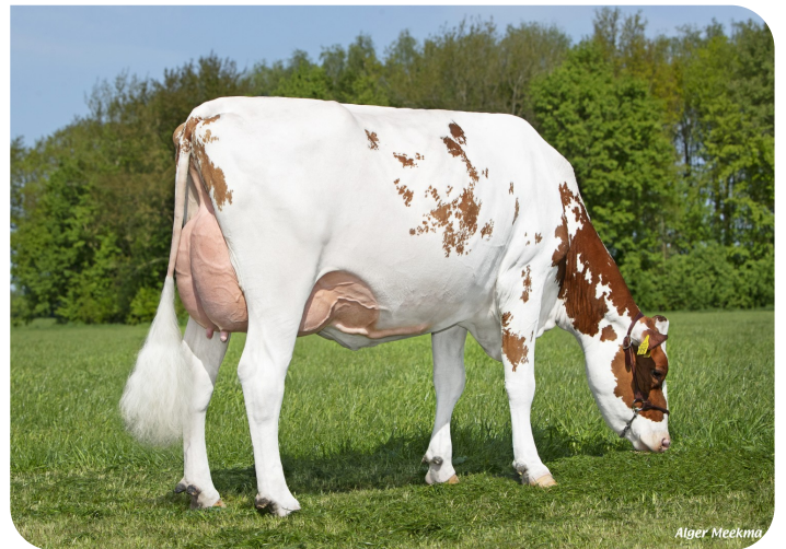
Grashoek Elsje 73 (s. Magician) Owner: Fok- en melkveebedrijf K.I. Samen B.V. (NL)