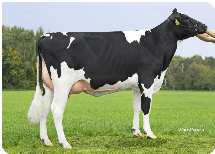
Grashoek Becky 45 (VG 86) (s. Aras) Owner: Fok- en melkveebedrijf K.I. SAMEN, Grashoek