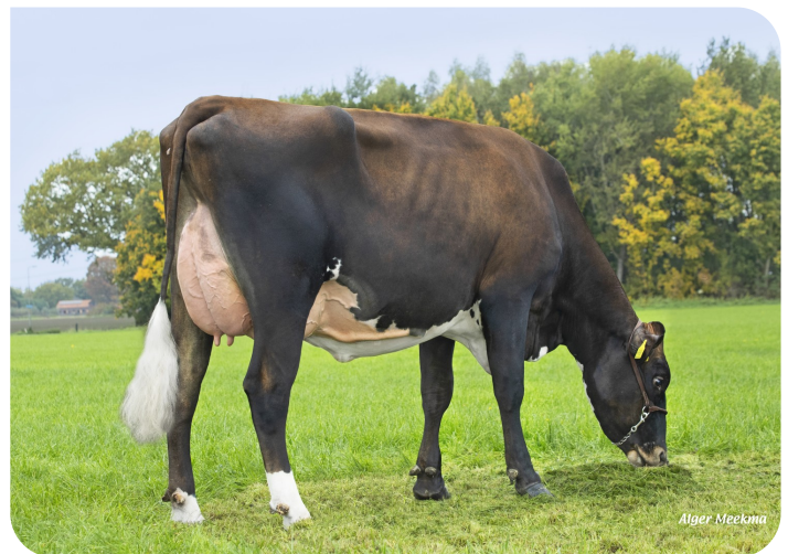
Grashoek Tonnie 108 PP (s. Aras, 75% HF, 25% BS) (VG 85) Owner.: Fok- en melkveebedrijf K.I. SAMEN, Grashoek