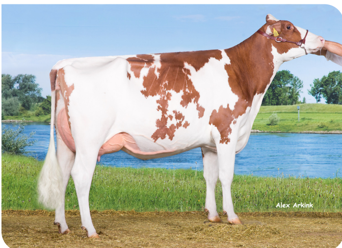
Drouner Ajdh Aiko 1288 (EX 90) (grand-dam of Aras (Pp))