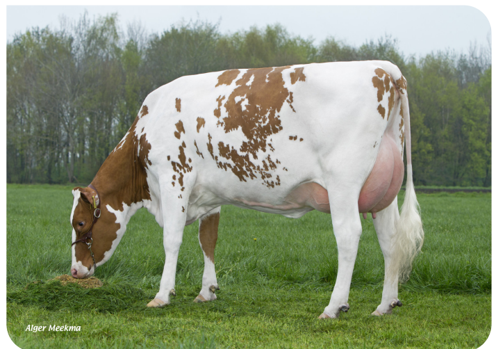
Grashoek Maria 94 (s. Galant) Owner: Melkveebedrijf Grashoek b.v., Grashoek (NL)