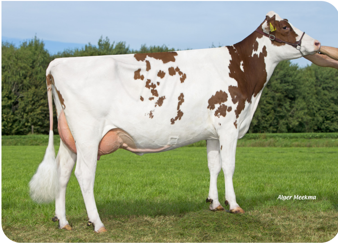
Grashoek Tonnie 74 (s. Galant) Owner: Melkveebedrijf Grashoek b.v., Grashoek (NL)