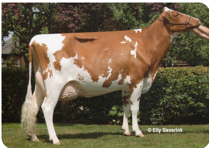
Mitzi (VG 89) (dam of Galant)