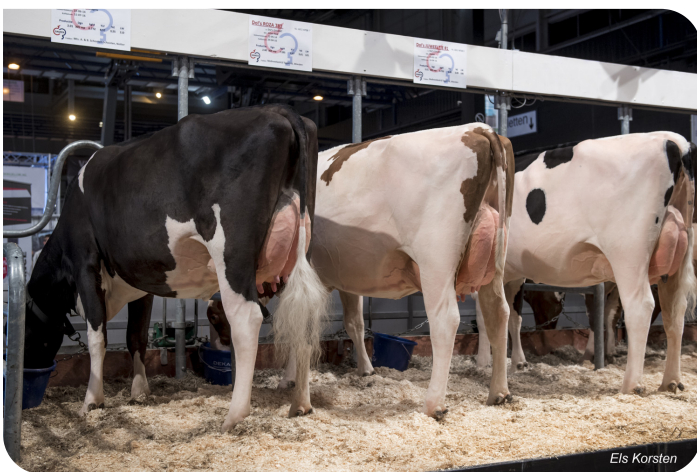
Galant daughtergroup Gorinchem 2016