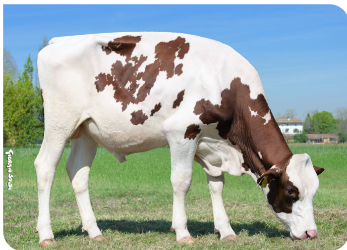
DG Antheum Red