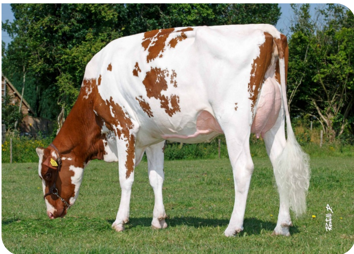
DG R Adalyn Red (v. Endco Argo) Grand dam of Antheum Red