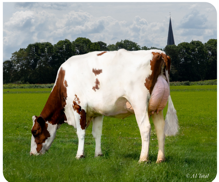
DG R Aliena Red (s. Solitair P)