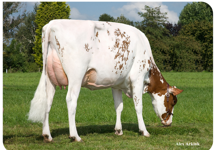
JK Eder All P Red (VG 86) (dam of All Star rc (PP))