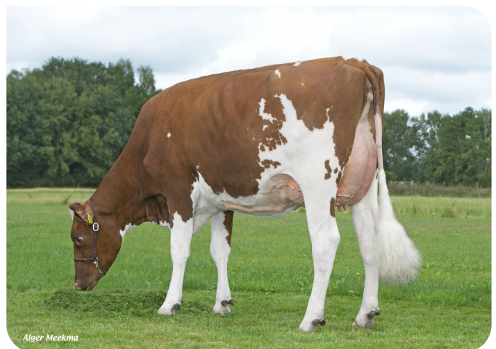
New Moore Maria 463 (VG 88) (s. Tedbull) Owner: Mts. Withaar-Prent, Nijeveen (NL)