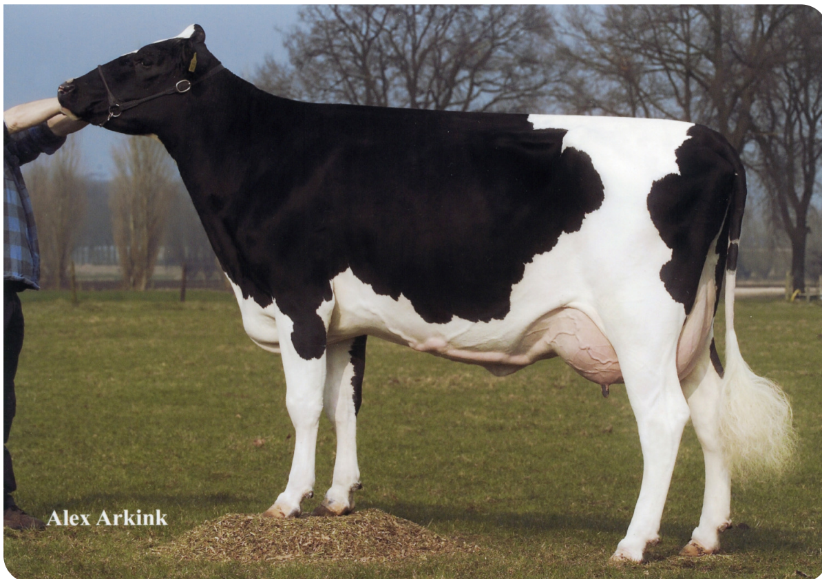
De Rith Tetje 119 (EX 90) (dam of Tedbull)