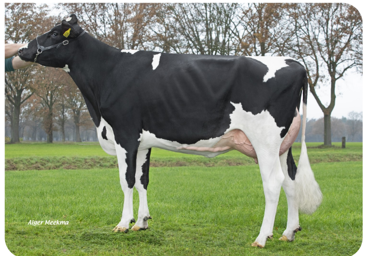
Kooifarm Tonia 29 (s. Davy) Owner: Klein Baltink C.V., Kring van Dorth (NL)