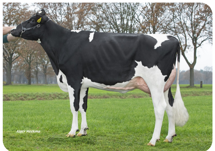
Kooifarm Tonia 29 (s. Davy) Owner: Klein Baltink C.V., Kring van Dorth (NL)