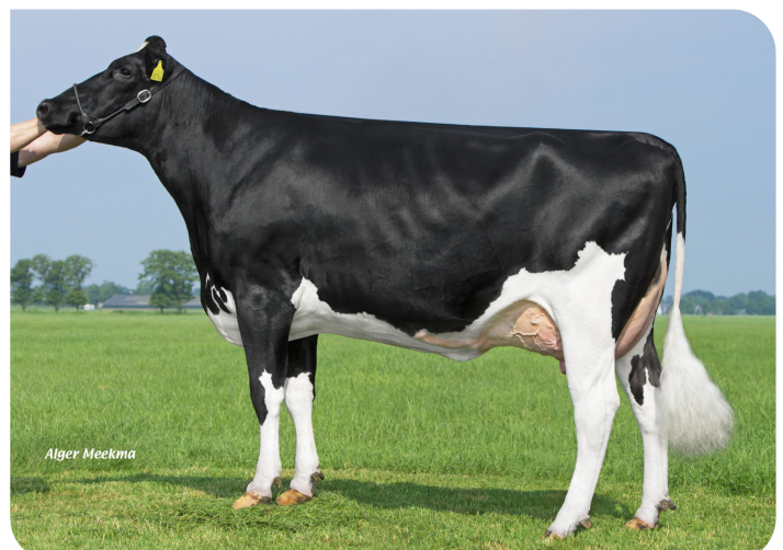
Willsbro Nuggett Aderyn (VG 85) (dam of Davy)