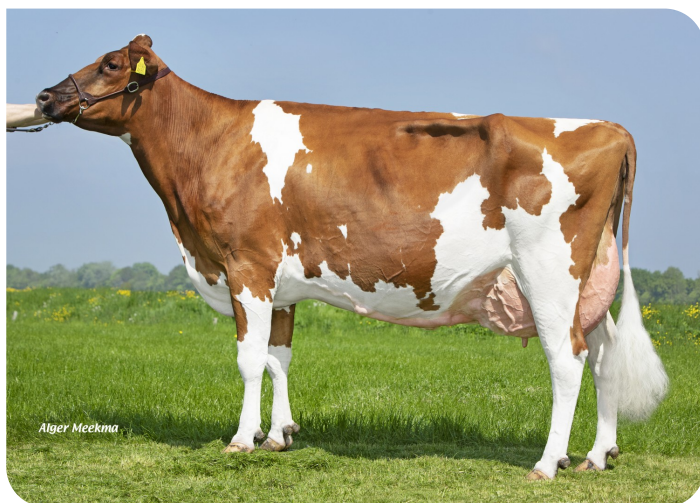
Bontje 170 (EX90) Dam of Kimi Red