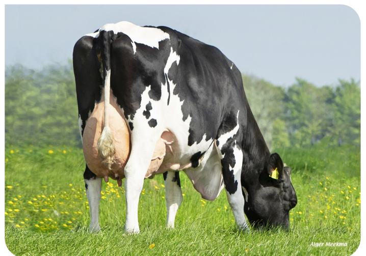
Emma 955 (VG 89) Dam of Body