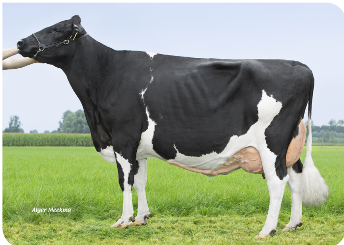
De Nautena Anna 129 (AB 88) Full sister of Meester