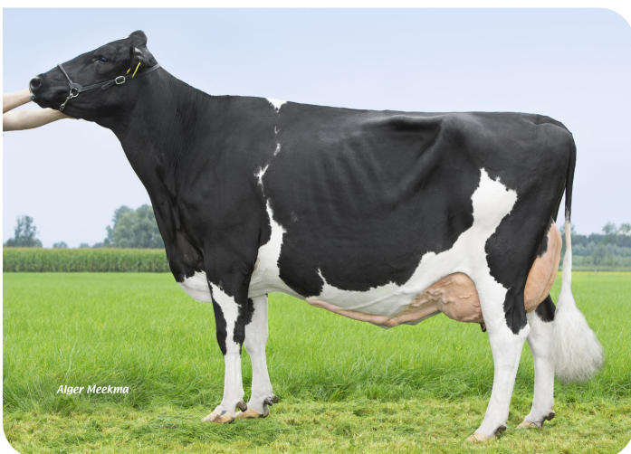
De Nautena Anna 129 (AB 88) Full sister of Meester