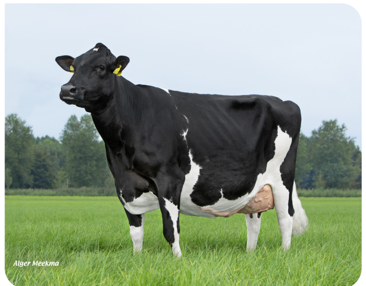
De Nautena Anna 129 (VG 88) Full sister of Meester