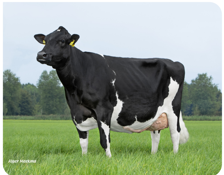
De Nautena Anna 129 (VG 88) Full sister of Meester