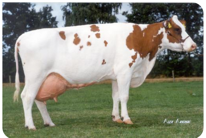
Hilda 98 (VG 89) (dam of Dani)