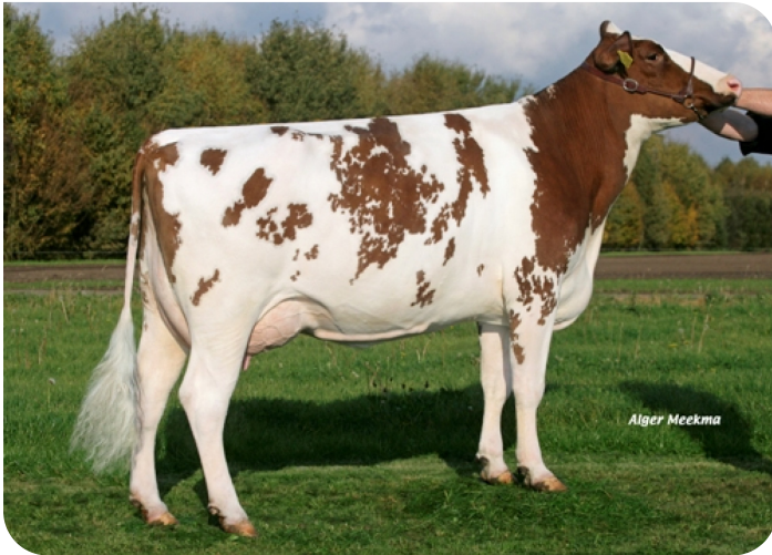
Roosje 275 (GP84) (s. Red Reflex)