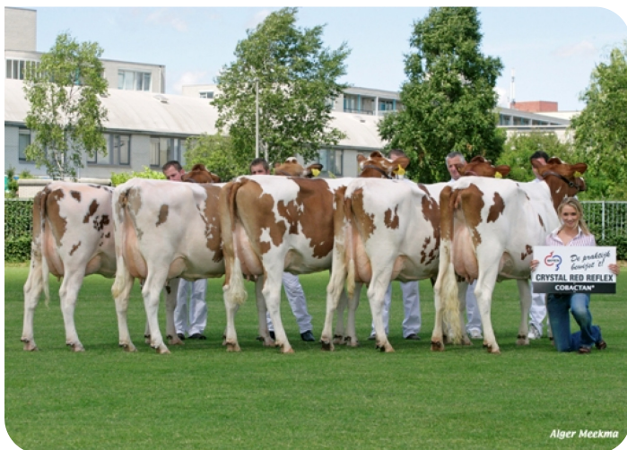
Daughtergroup Red Reflex NRM 2008