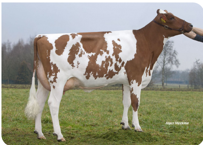
Grashoek Liza 413 (s. Cracker W rf) Owner: Melkveebedrijf Grashoek b.v., Grashoek (NL)