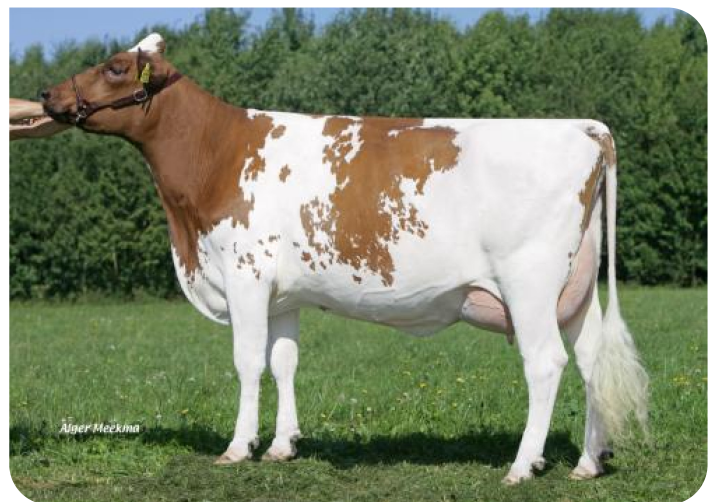
Grashoek Lamberthie 31 (s. Cracker W rf) Owner: Mts. Bos Dairy, Veenoord (NL)