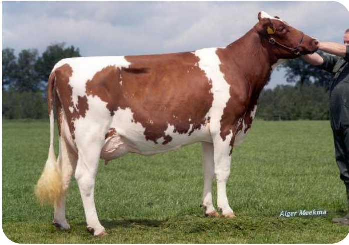
Ruth 31 (VG 88) (full-sister of Cracker W's granddam)