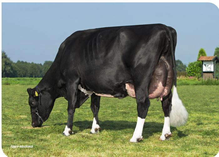
Grashoek Iva 4 (s. Cracker W rf) (3th lactation) Owner: Melkveebedrijf Grashoek b.v., Grashoek (NL)