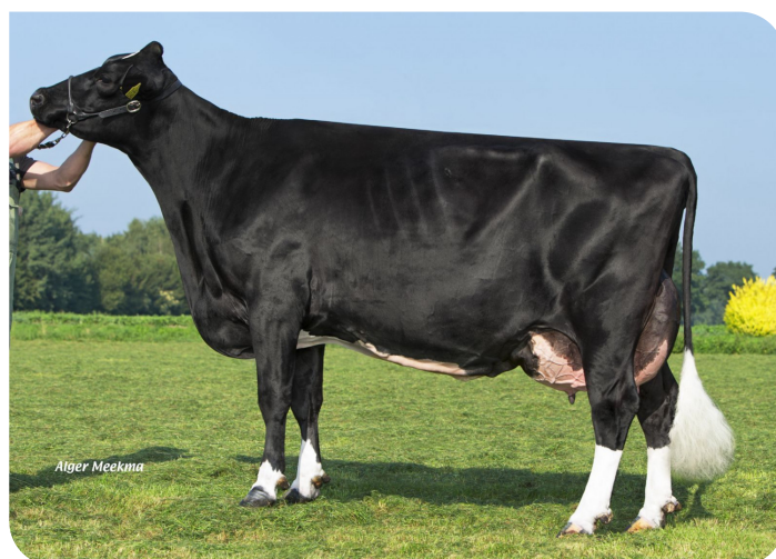
Grashoek Iva 4 (s. Cracker W rf) (3th lactation) Owner: Melkveebedrijf Grashoek b.v., Grashoek (NL)