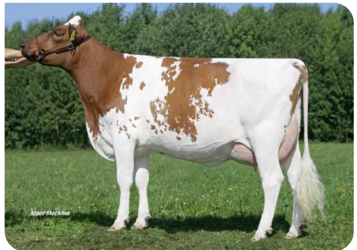
Grashoek Lamberthie 31 (s. Cracker W rf) Owner: Mts. Bos Dairy, Veenoord (NL)