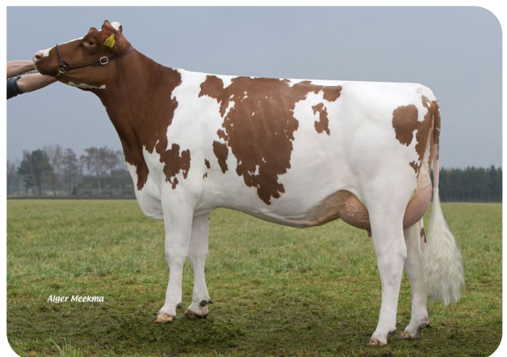
Grashoek Liza 410 (s. Cracker W rf) Owner: Melkveebedrijf Grashoek b.v., Grashoek (NL)