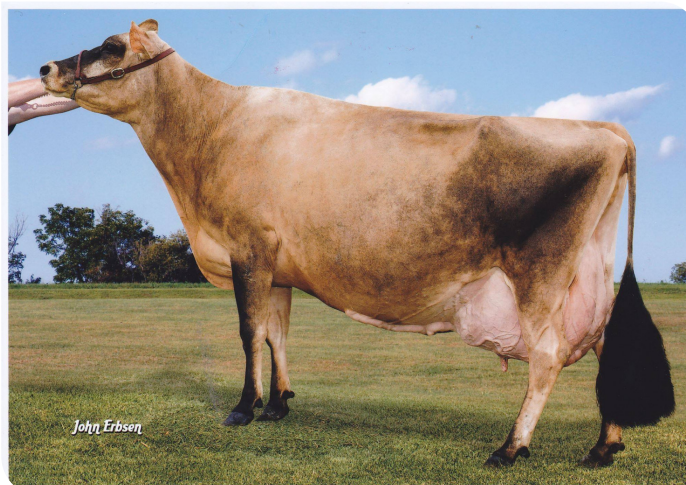
Sunset Canyon Centurion L Maid 2 (grand-dam of Mace-P)