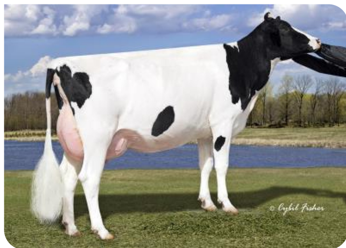
Seagull-Bay Miss America (VG 87) (dam of Aviator)