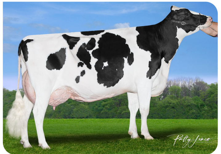
Claynook Reba Wickham (EX 93) Dam of Miramax