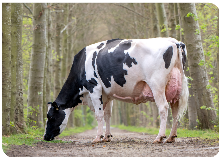
Broeklander Chrispen 2 Dam of Edjurre