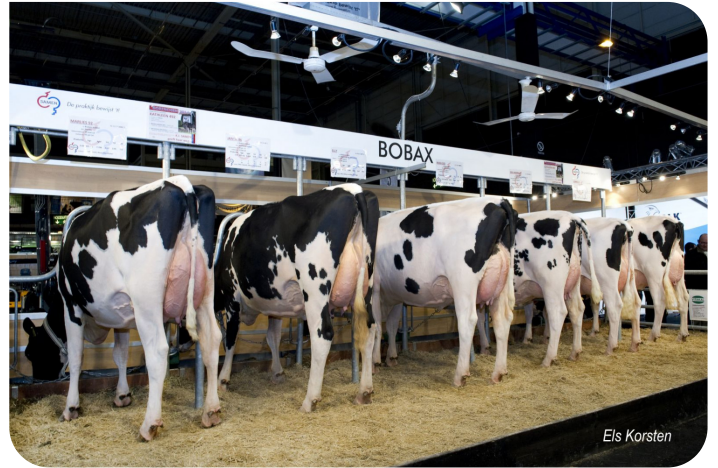
Bobax daughtergroup Gorinchem 2014