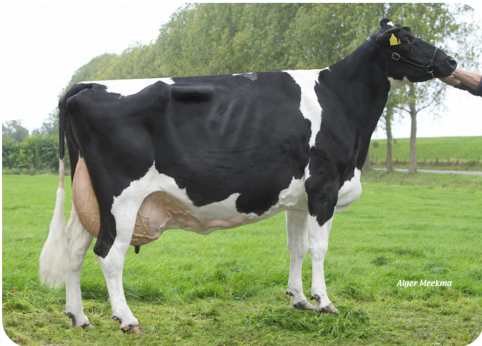
Gerda 15 (EX 90) (dam of Bobax)